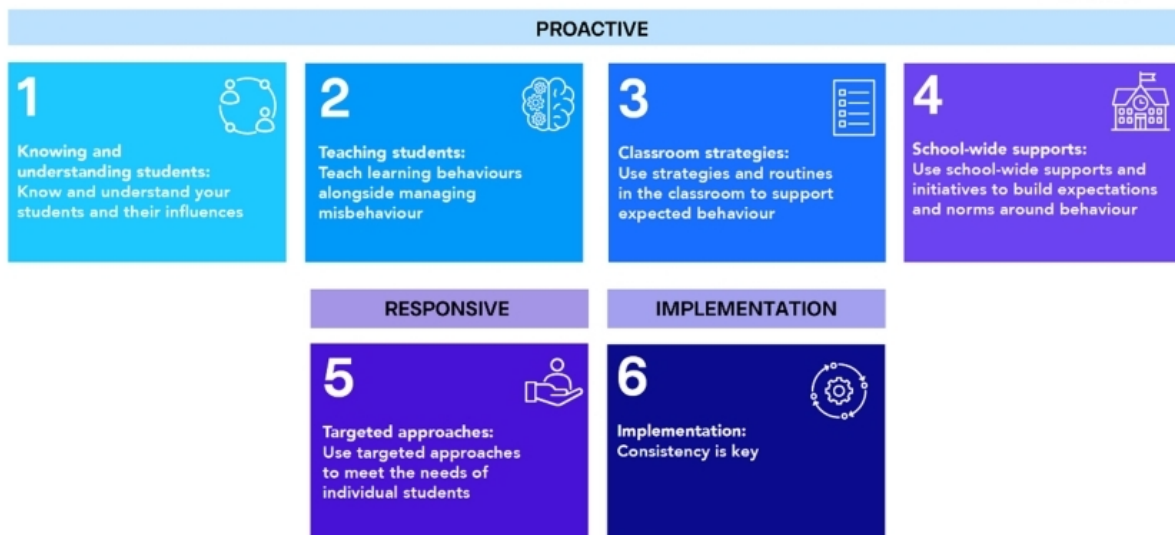
Figure 1. The 6 recommendations from Effective Behaviour Supports for Schools (Evidence for Learning, 2023)

Our aim is to have students who are flourishing. This means, they are happy, engaged and connected to each other and our school with a clear identity and purpose. GGS is committed to safeguarding and promoting the safety, welfare and wellbeing of children and young people. The purpose of our PBSP is to be consistent, proactive and responsive, with fair and proportionate responses to behaviour, that utilise best practice in line with School policies and procedures.